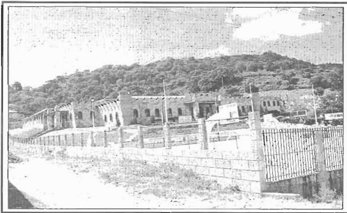
Good Samaritan High School