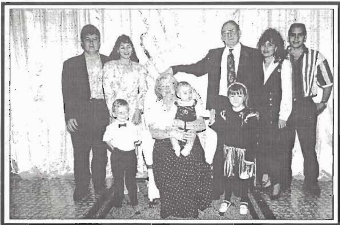
The Tyson Family