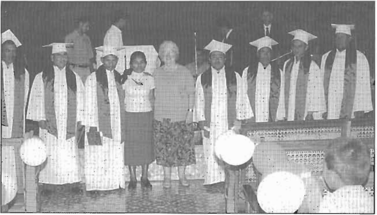
Seven pastors graduated from the Bible Institute in Condega, Nicaragua, and on the same day seven more were ordained to the ministry.