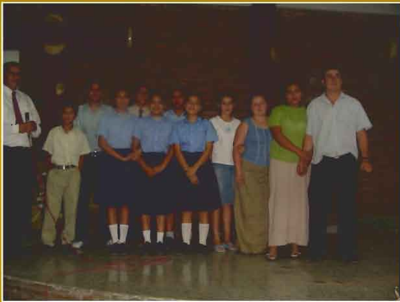
Eleven Baptized in Good Samaritan Baptist Church in San Marcos de Colon, Honduras