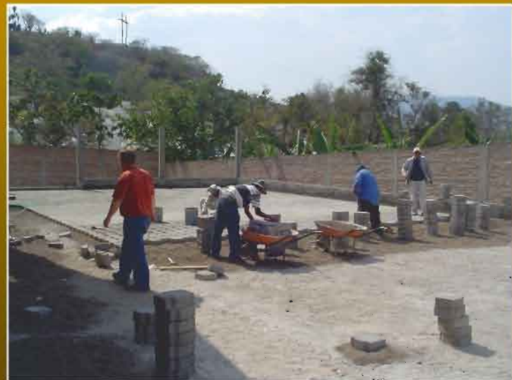
Laying Block in front yard of Good Samaritan Grammar School