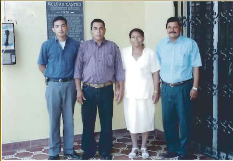
This couple, recently saved, are married legally in San Lorenzo, shown here with son and Pastor