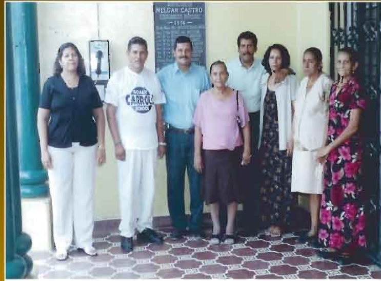
Two more couples married by the judge are shown here with their families