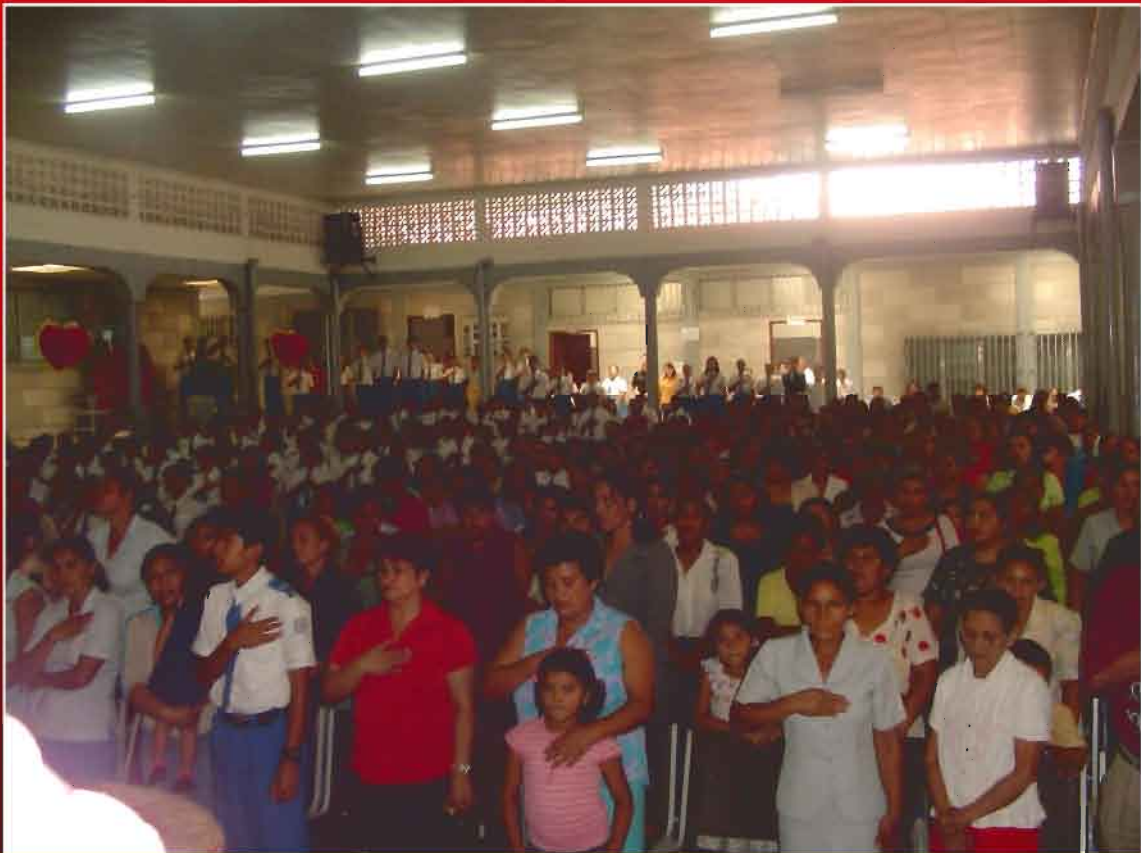
Mothers day program at Good Samaritan Baptist High School Record enrollment in 2005 of 613 students