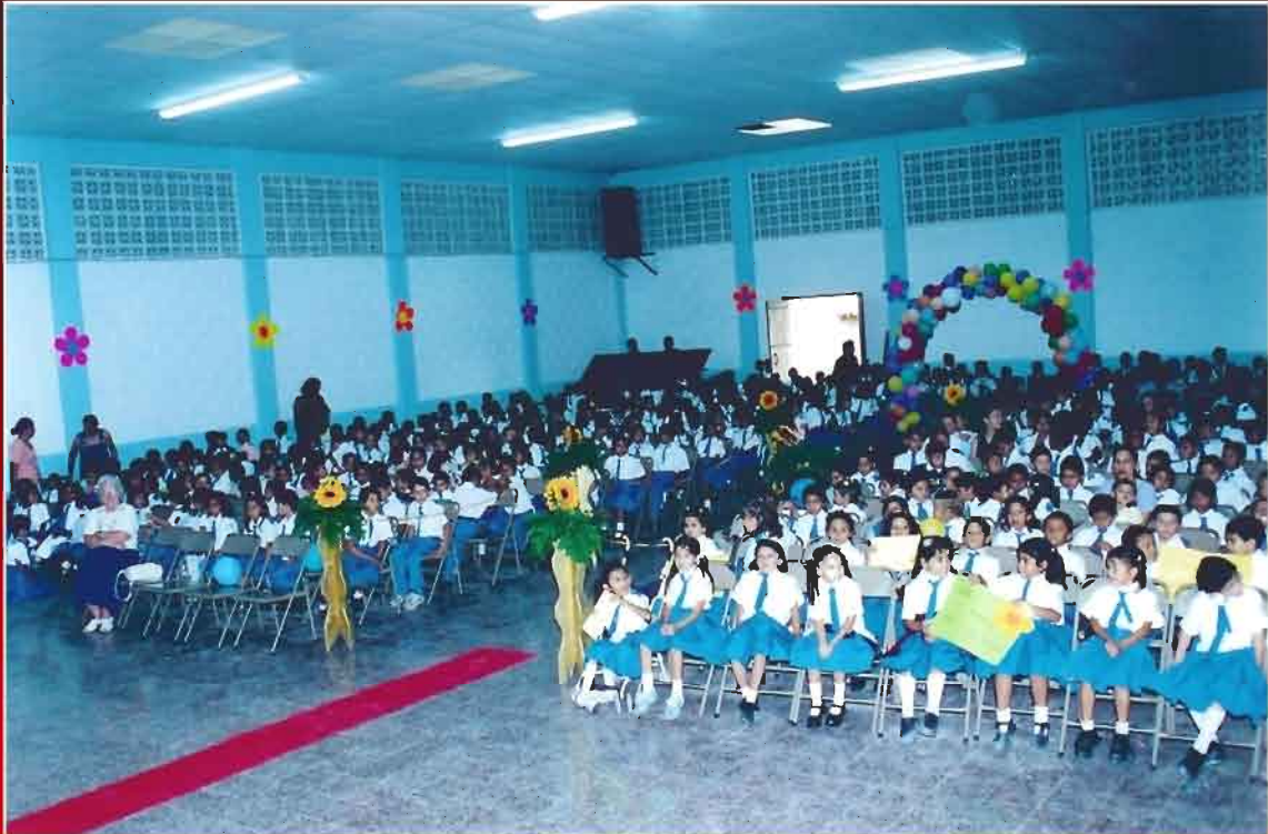
Good Samaritan Baptist Grammar School in San Marcos de Colon, Honduras 577 Students enrolled in 2005