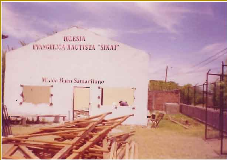
Sinai Baptist in Choluteca, Honduras being torn down to get ready for new building