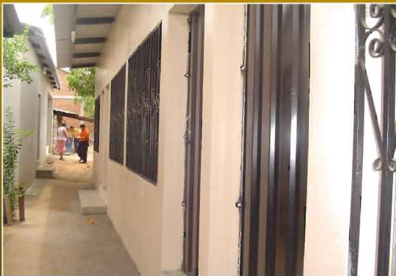
New S.S. Rooms and Pastorium in Maranatha Baptist Church, our third church in Choulteca