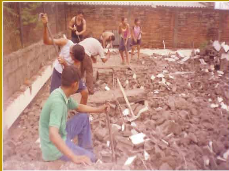
Even the women and the children are helping to clean off the lot