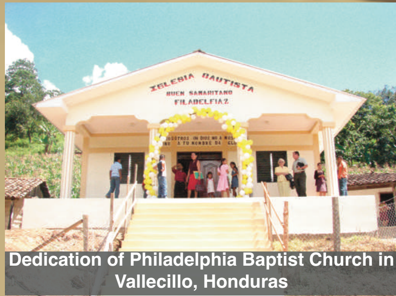
Dedication of Philadelphia Baptist Church in Vallecillo, Honduras