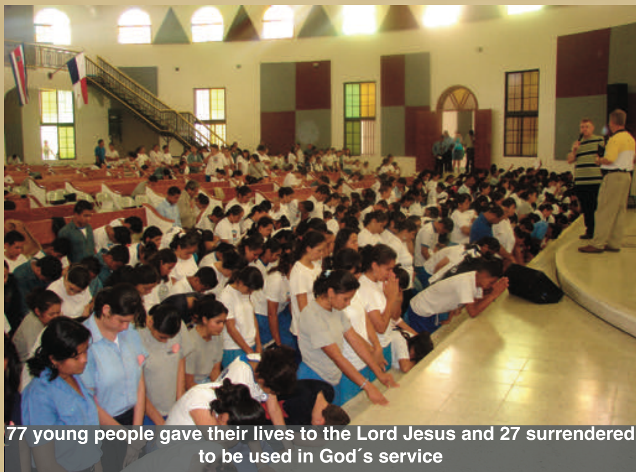
77 young people gave their lives to the Lord Jesus and 27 surrendered to be used in God's service