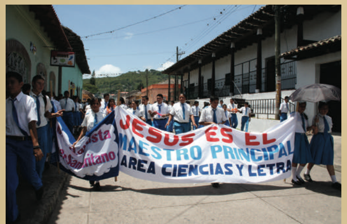
Over 1200 of our students marched in the Independence Day parade. This banner says that Jesus is our Principal Teacher