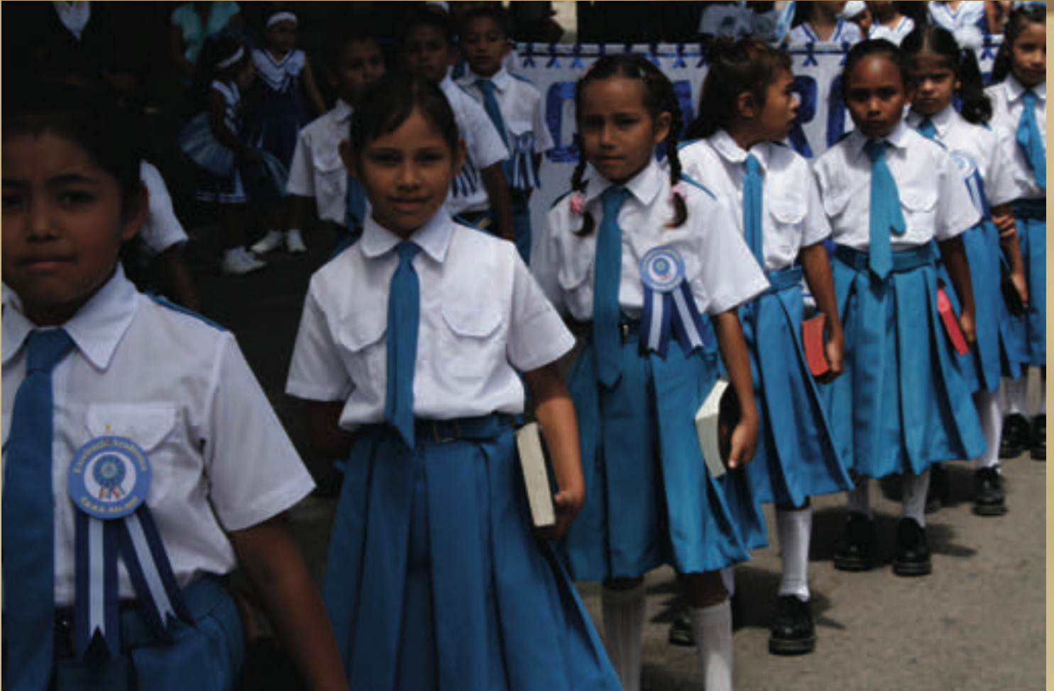
Primary School children marching in the streets of San Marcos de Colon, Honduras with their Bibles in their hands