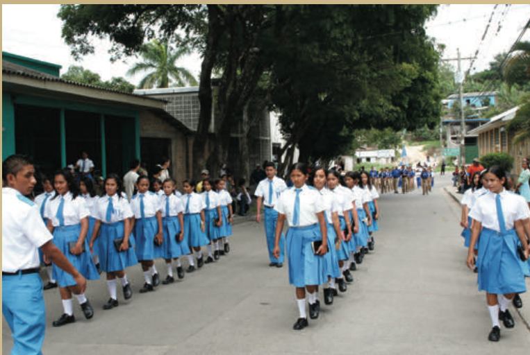
The Parade lasted for over 6 hours