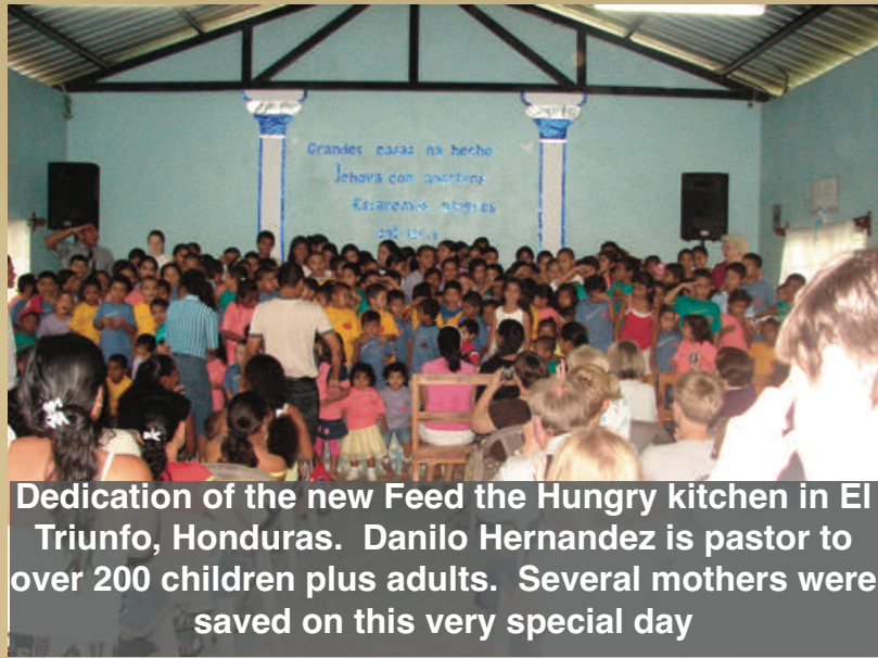
Dedication of the new Feed the Hungry kitchen in El Triunfo, Honduras. Danilo Hernandez is pastor to over 200 children plus adults. Several mothers were saved on this very special day