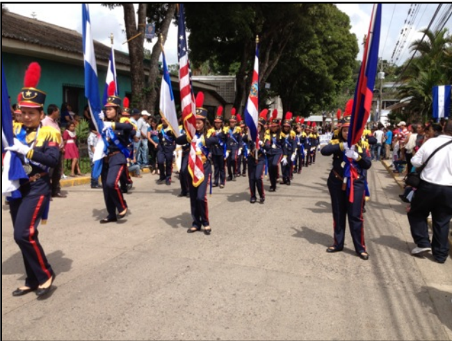
Good Samaritan honor roll students marching in the Honduras Independence Day Parade