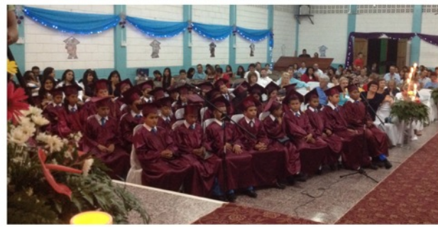
72 students graduating from the 6th grade in our Grammar School