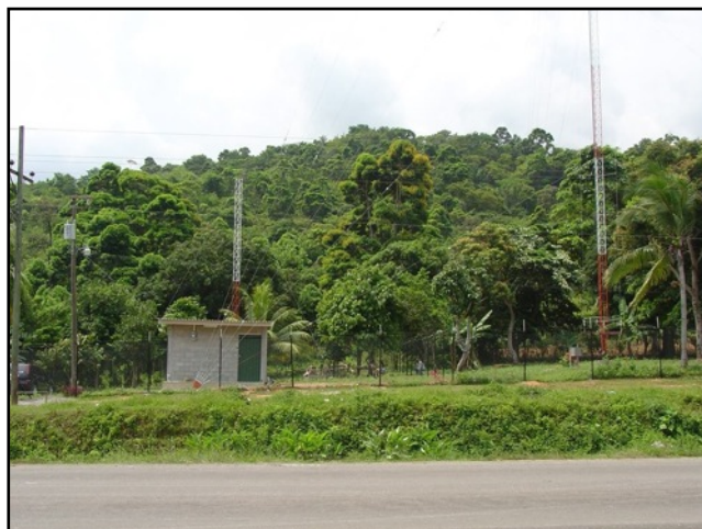
930 AM station in La Ceiba, Honduras

Please pray about supporting the radio ministry because the monthly budget to maintain all of these stations is approximately $20,000. We realize that our purpose and goal is to see souls saved and this is something that we have strived to accomplish for the last 23 years. It will be amazing the day that we get to Heaven and we are able to see all the faces of those that have been touched because of this ministry. We have felt the attacks of Satan, but with the help of our Lord and Savior Jesus Christ we will continue forward carrying the Gospel of Jesus Christ to these countries of Central America and, of course, through the internet all across the world.