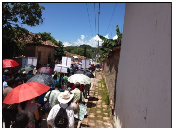
Christians marching with Bible in hand for National Bible Day, held all over Honduras and Nicaragua