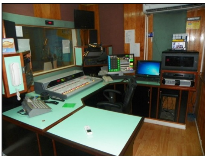
Radio headquarters in Tegucigalpa, Honduras

The year 2013 has been one of the greatest years for the radio ministry. With approximately 7000 salvations received and thousands of phone calls, without a doubt, the countries of Central America like Belize, Guatemala, El Salvador, Nicaragua, and Honduras are being saturated with the Gospel. We would like to thank everyone that has had a part in supporting the radio ministry because without it, this would not be possible. Please continue to pray for this ministry because we are now in the process of building a new station on a 3000 foot mountain that borderlines Honduras and Nicaragua. We expect to reach the northern and central parts of Nicaragua with this station and the majority of the towns and villages where Good Samaritan Baptist Mission have established churches. This is very exciting for us because we also have another radio station on the eastern part of Honduras that is