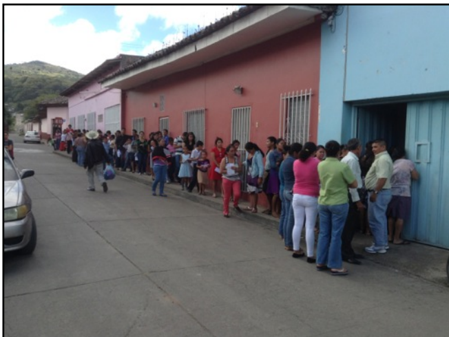
Children lined up outside our offices to receive their Christmas gifts from their sponsors