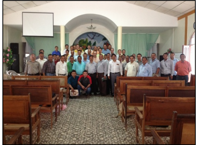
Good Samaritan national pastors in Nicaragua - Please consider supporting one of these men on a monthly basis