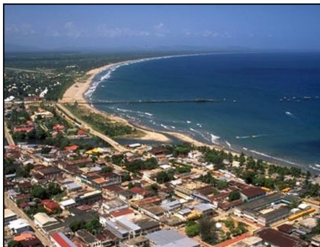
City of Tela, Honduras - 103.5 FM Samaritan Radio

In the year 2006, our historic 9th radio station was built in the city of Tela, Honduras. Being the first Christian radio station in this city in over 400 years, the impact that this station has had is truly overwhelming. Now 8 years later, only God knows just how many people have been saved through this FM station. The African-Honduran people have truly responded to the Gospel because on a daily basis approximately 40 to 50 calls are received from this area of Honduras. It is such a blessing to be able to drive from coast to coast to the different regions of this country and hear the Gospel preached to the hundreds of thousands of souls. Many times it seems like a dream. For man it is impossible, but for God all things are possible.