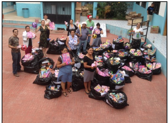
Christmas toys being packed up to be given out to about 12,000 children in Honduras and Nicaragua