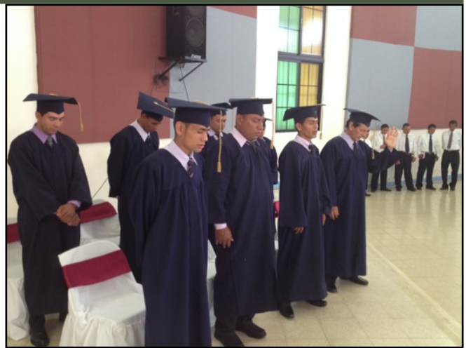
8 new Bible School graduates - All of these young men are already pastoring or raising up new works