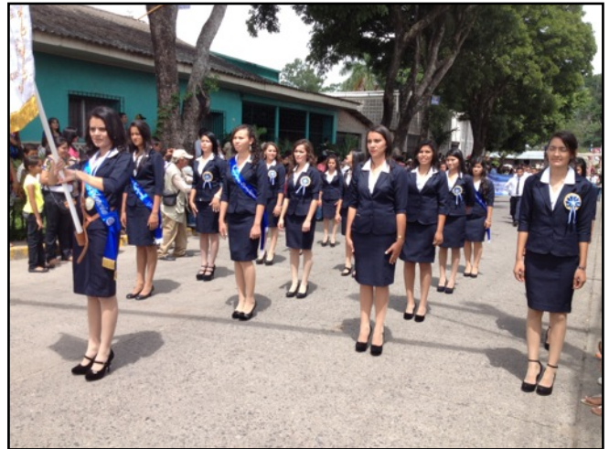
Seniors marching in the Honduras Independence Day Parade