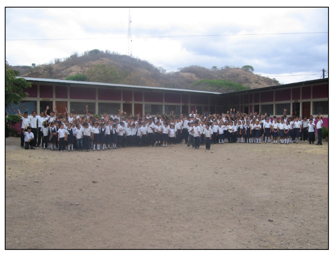
We have the blessing of having two Christian schools in Condega and La Trinidad, Nicaragua.