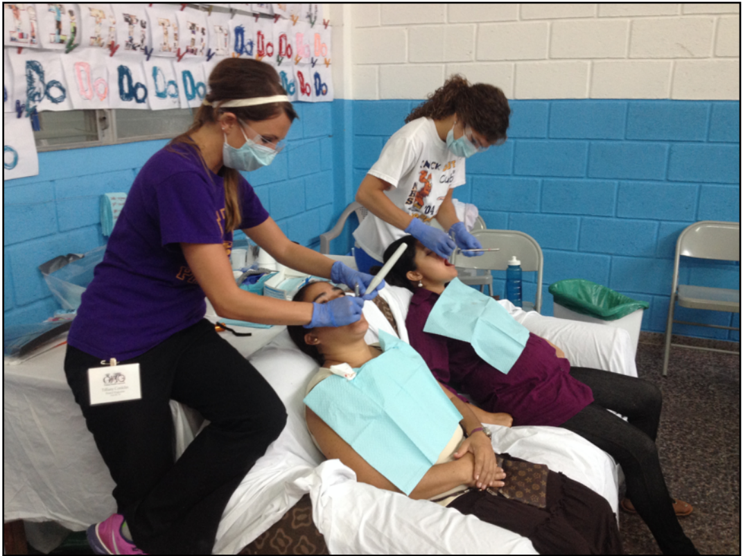
Global Health Outreach set up shop in our Grammar School for a week and attended the people in San Marcos and outside areas with medical and dental care while presenting the Gospel to each patient they saw.