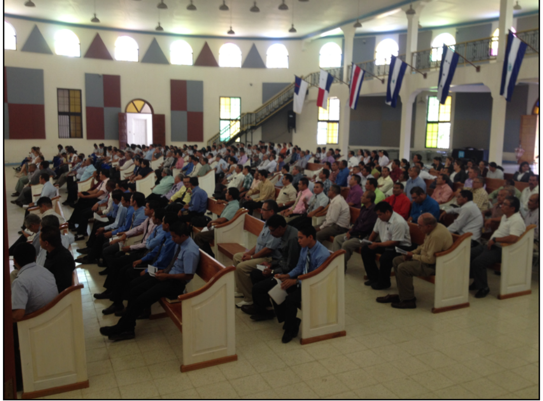
We had the privilege of having 3 men from the organization "Answers in Genesis" to come and hold a conference with our pastors, teachers and high school seniors.