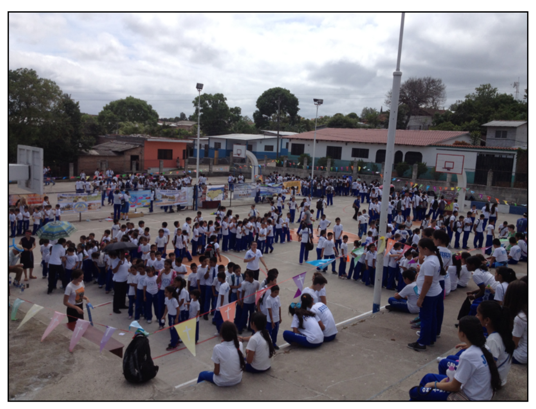
The youth group from Calvary Baptist in Simpsonville, SC (pictured above) had a carnival filled with games and prizes for our Grammar and High School students. They had so much fun and it was a great blessing for the students