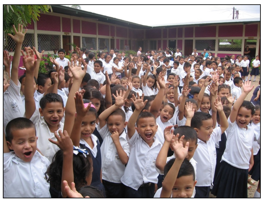
Our grammar school in Condega, Nicaragua is filled with about 300 beautiful children.